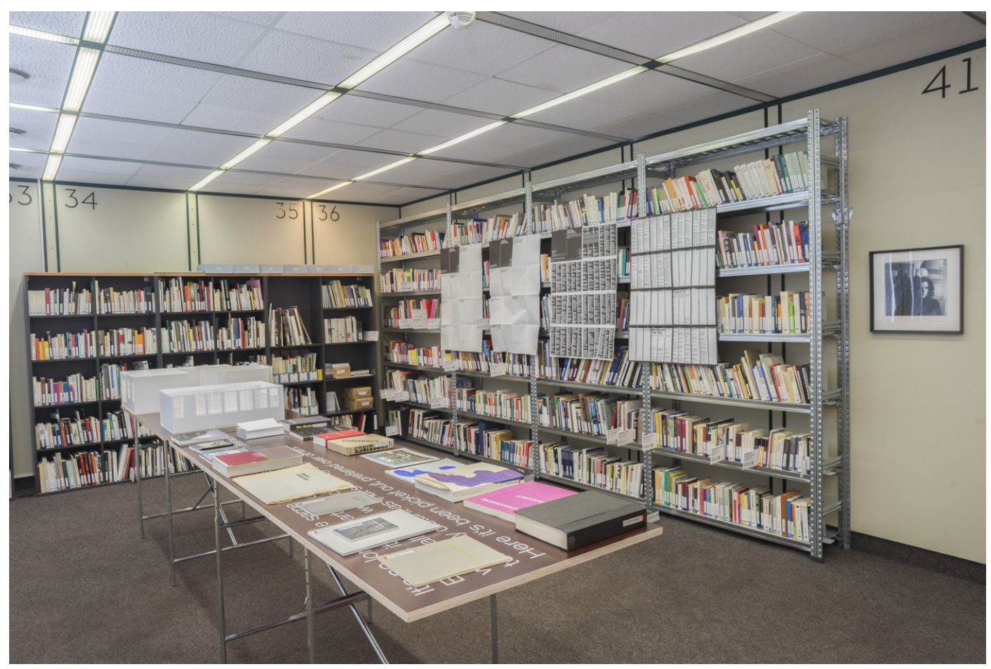
Wall text (vinyl cut), shelf signage (foamboard/ vinyl cut), installation with models and publications of CATHRIN PICHLER, desk (400x80cm), selection of books by CR three models (different sizes, foamboard), poster of A Retrospective part 1-3 , (1/1, 70x100cm, print run 500, folded, shelf/floor), poster of A Retrospective part 4 (1/1, 70x100cm, print run 250, folded, shelf/floor)