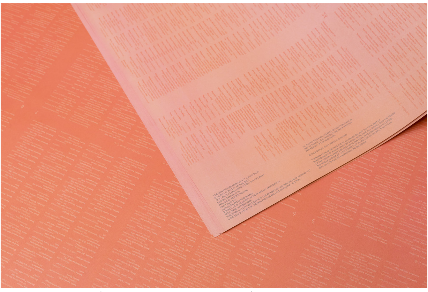
poster Cathrin Pichler Archive A-Z (4/4, 70x100cm, print run 200, on palett, partly folded), comprising all books in the library/ archive