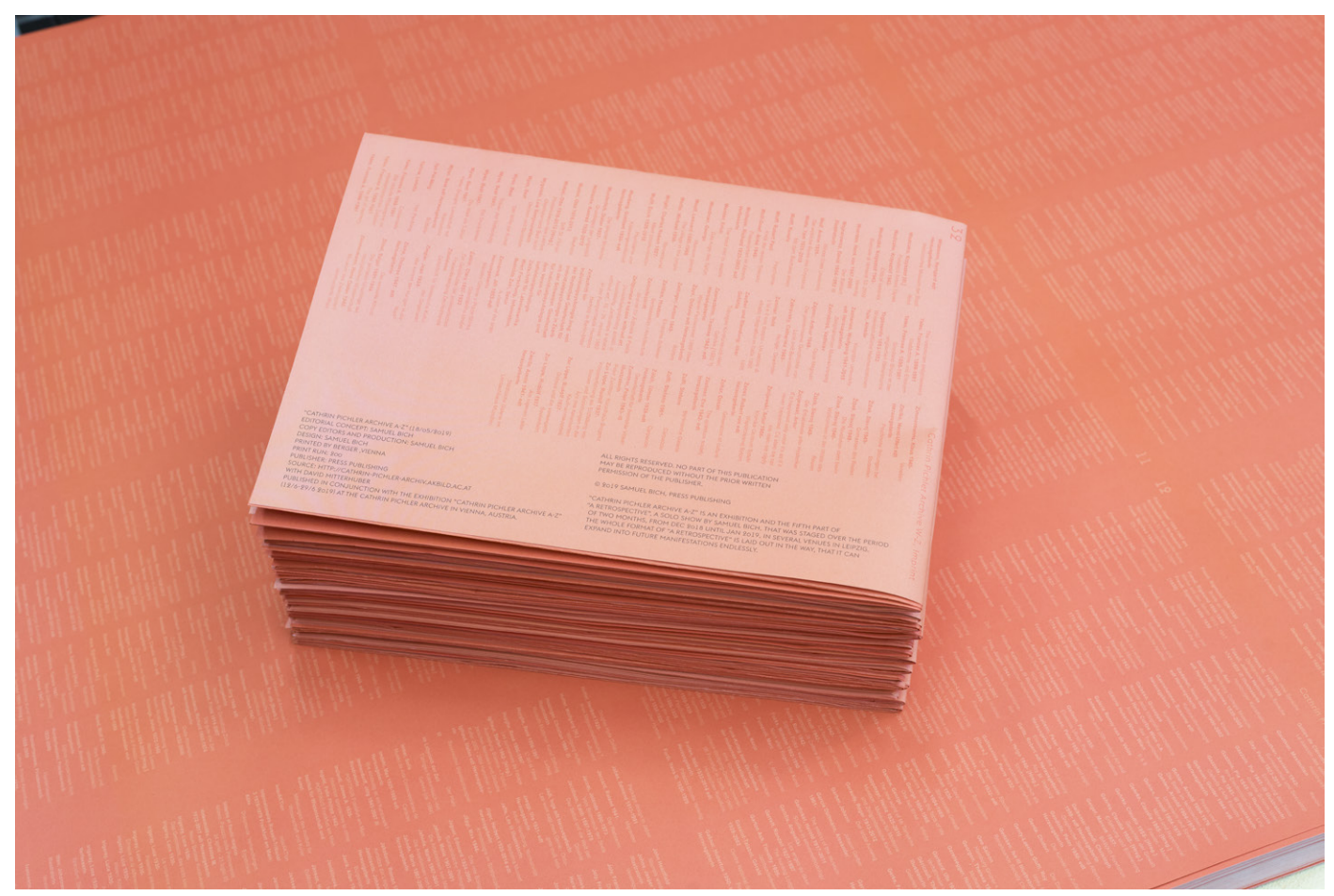
poster Cathrin Pichler Archive A-Z (4/4, 70x100cm, print run 200, on palett, partly folded), comprising all books in the library/ archive