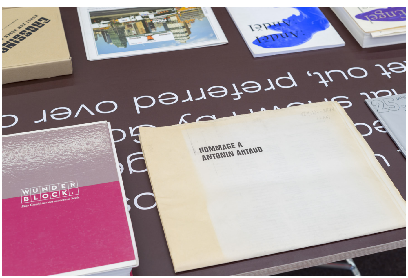
installation with publications of CATHRIN PICHLER, desk (400x80cm)