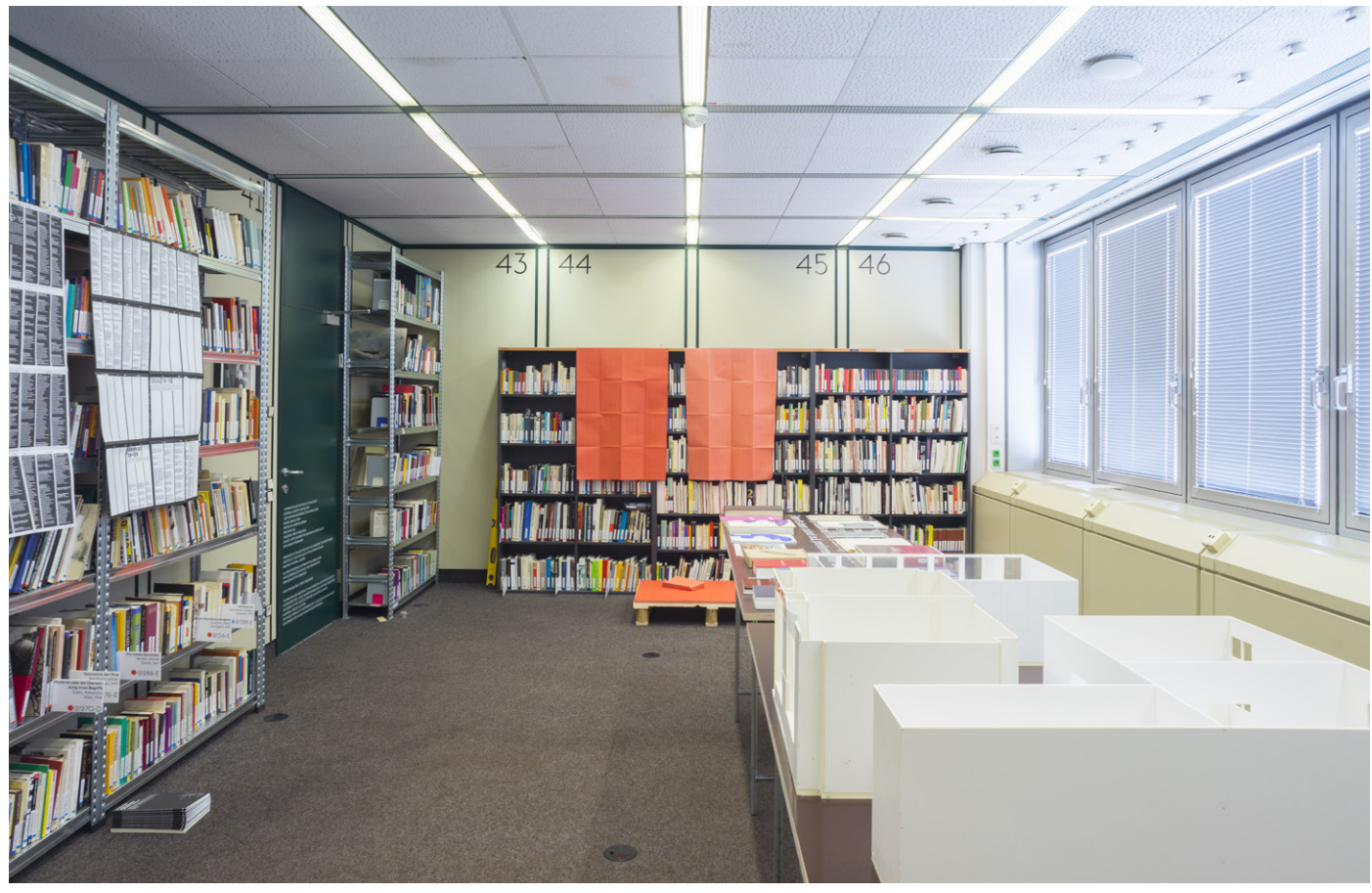
Wall text (vinyl cut), shelf signage (foamboard/ vinyl cut), installation with models and publications of CATHRIN PICHLER, desk (400x80cm), selection of books by CR three models (different sizes, foamboard), poster Cathrin Pichler Archive A-Z (4/4, 70x100cm, print run 200, on palett and shelf, partly folded), poster of A Retrospective part 1-3 , (1/1, 70x100cm, print run 500, folded, shelf/floor), poster of A Retrospective part 4 (1/1, 70x100cm, print run 250, folded, shelf/floor)

Wall text (vinyl cut), shelf signage (foamboard/ vinyl cut), installation with models and publications of Cathrin Pichler desk (400x80cm), selection of books by C.P., three models (different sizes, foamboard), poster 1 (4/4, 70x100cm, print run 200, on palett and shelf, partly folded), poster 2, (1/1, 70x100cm, print run 500, folded, shelf/floor), poster 3 (1/1, 70x100cm, print run 250, folded, shelf/floor)